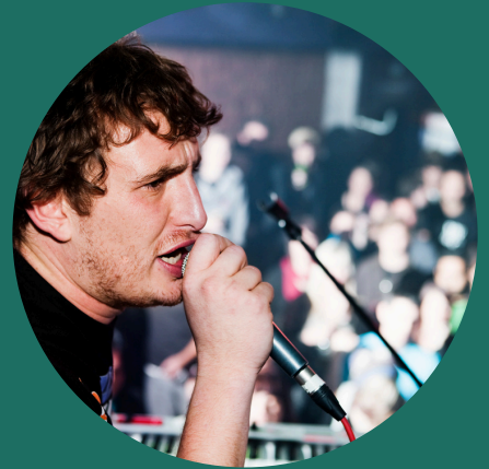
Performance Anxiety - How Can We Overcome It?