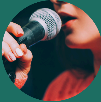
Mindful Diction for an Efficient Performance