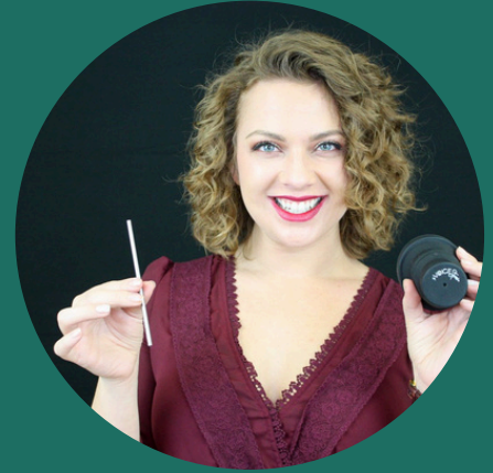
Harnessing the Power of SOVT and Straw Phonation