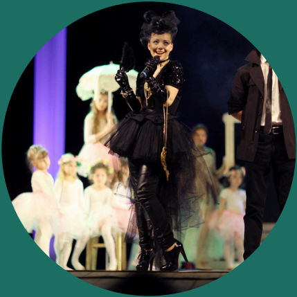
Musical Theater: Voice Technique and Artistic Need