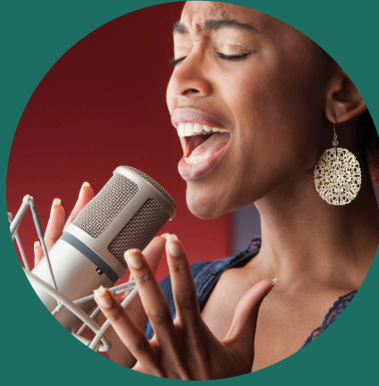
Becoming an Authentic Music Artist