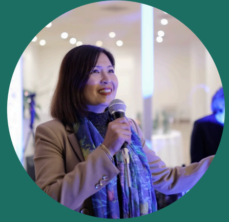
How to Perform at a Jam Session