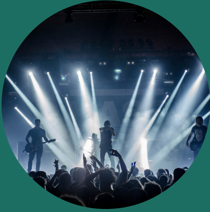
Beyond the Studio: Preparing Artists for Touring Excellence