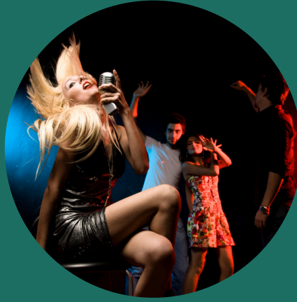
Whole Body Resonance: Integrating Physical Awareness for Vocal Excellence