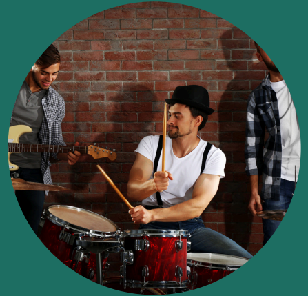
I've Got Rhythm